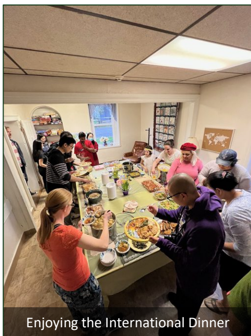
Enjoying the International Dinner

"Thank you from the bottom of my heart for arranging the retreat and having us all come together. I always feel renewed in my soul after spending the retreat here. Thanks so much!!!" –Muslim student