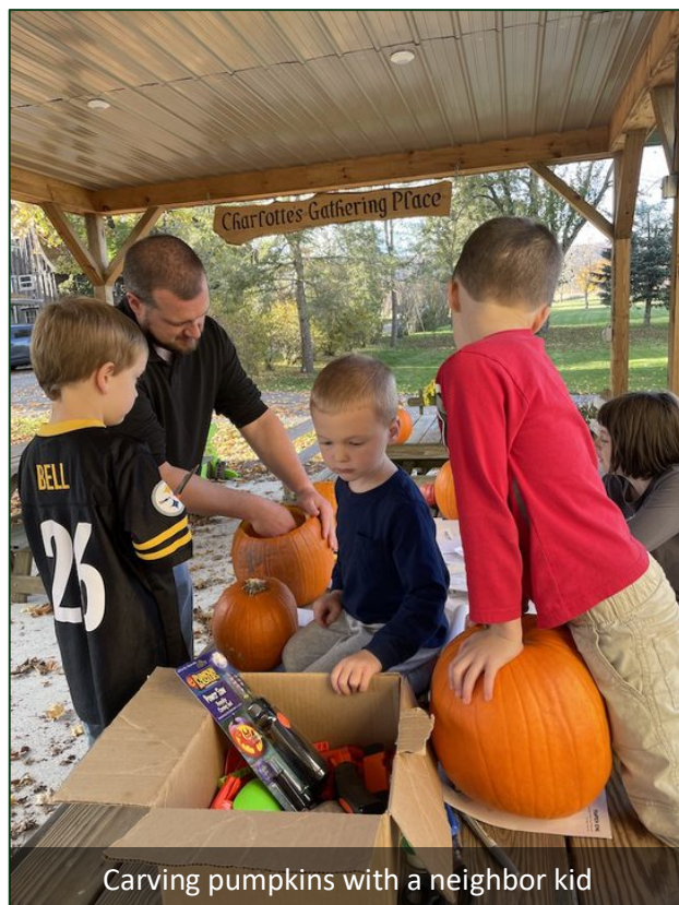
Carving pumpkins with a neighbor kid