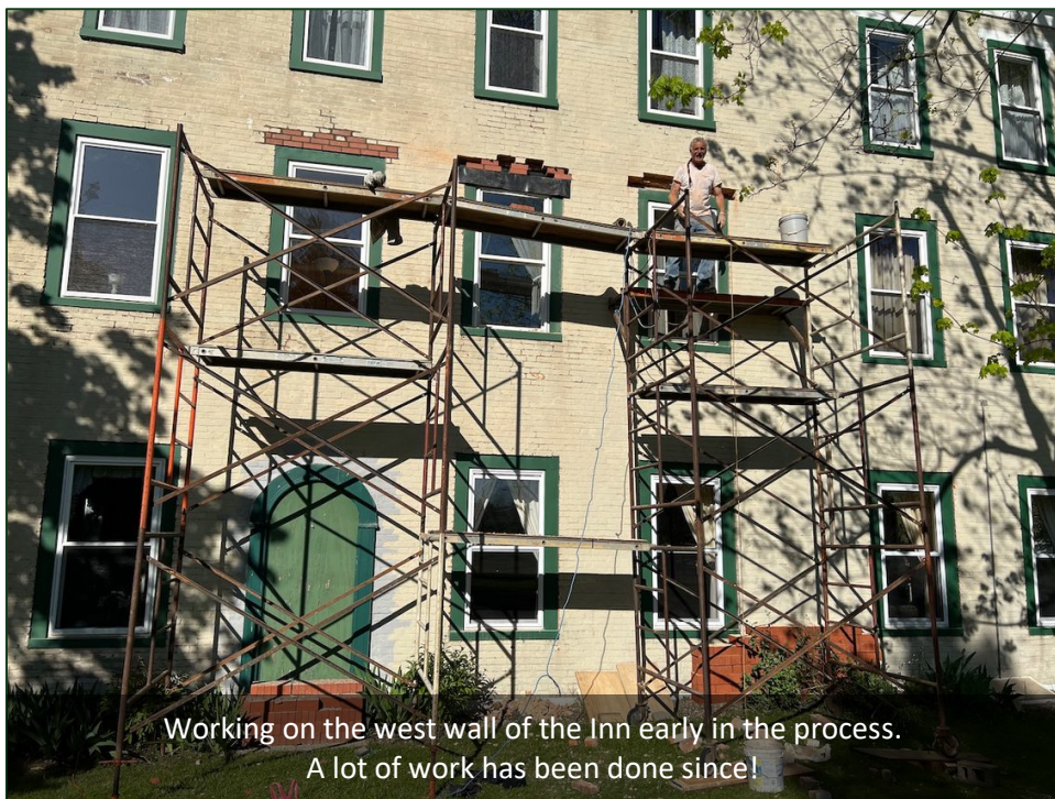
Working on the west wall of the Inn early in the process. A lot of work has been done since!