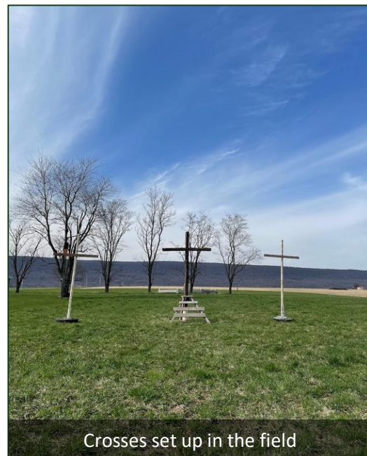
Crosses set up in the field

really a solution to many problems in the world: in her country (China), the war in Ukraine, etc. Another student said that she had her confidence restored. She realized she had grown in her knowledge of Jesus when she knew the questions that another student asked." –ISI staff member