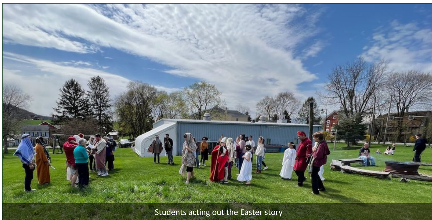
Students acting out the Easter story

We have been at SPADE for over a year now. One of the biggest highlights for us was hosting our first Easter conference in April. Our children loved being involved in acting out the Easter story and getting to know students. To spend Easter hosting international students and sharing our risen Savior and eternal hope was an indescribable blessing.